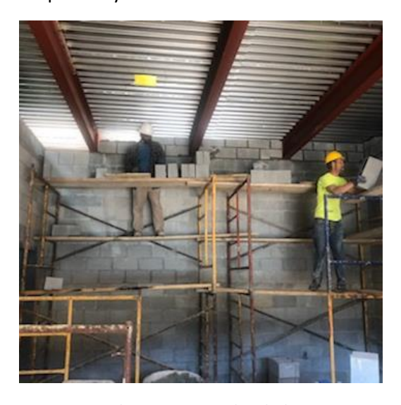
Figure 1 S. Atl –CMU to extend to deck