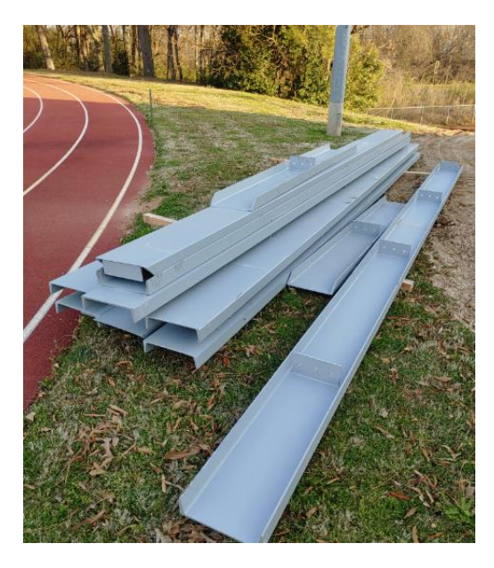
Figure 4 Carver – Roof Steel