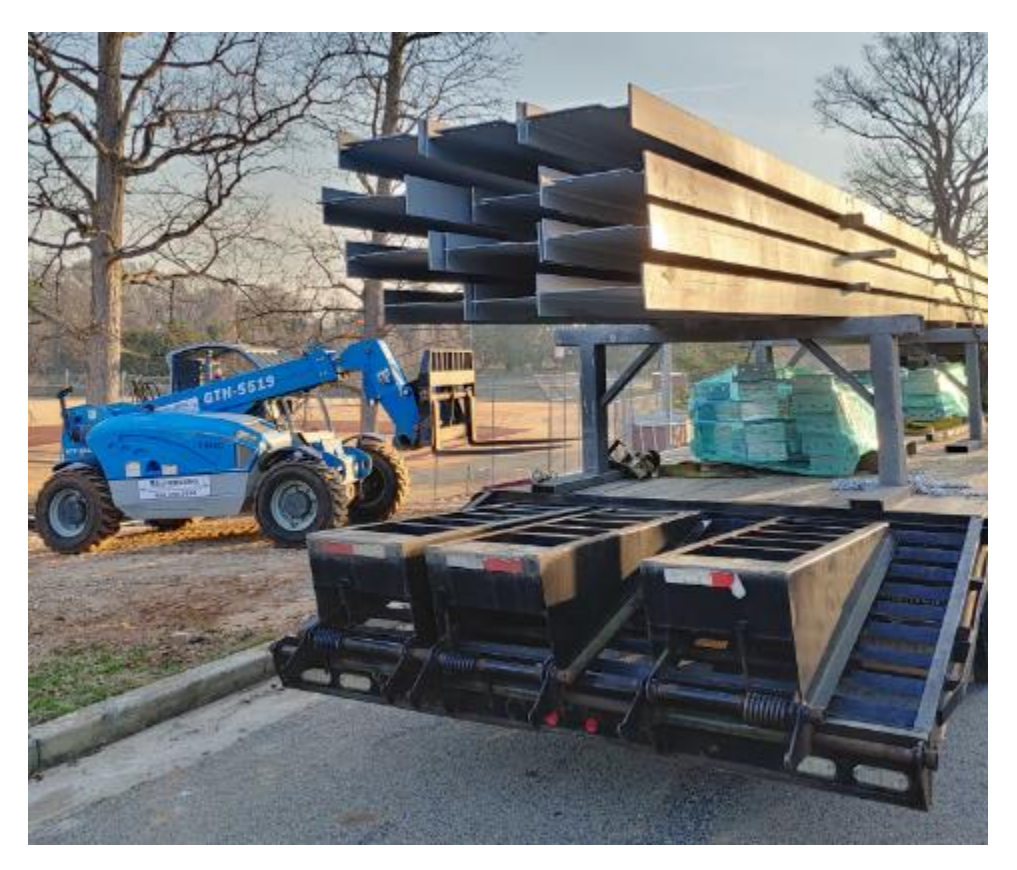
Figure 5 – Carver Steel Deliveries