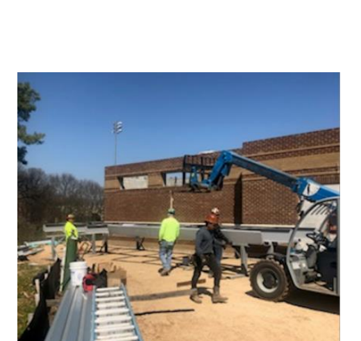
Figure 3 Carver – Steel Erector Mobilization, Steel Decking